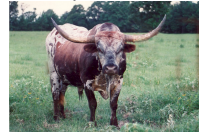
HTJ Perfect 10 Again