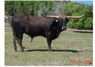
J.R. HOCUS POCUS