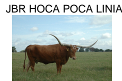
JBR HOCA POCA LINIA