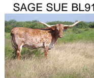
SAGE SUE BL915