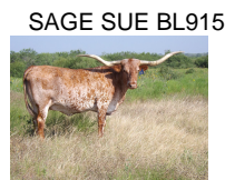
SAGE SUE BL915