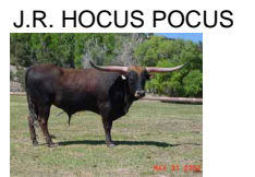
J.R. HOCUS POCUS