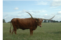
JBR HOCA POCA LINIA