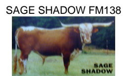
SAGE SHADOW FM138